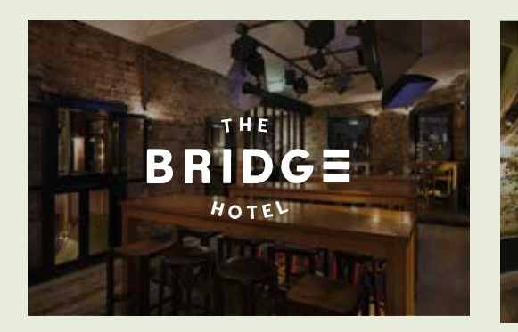
642 Bridge Road, Richmond thebridgehotel.com.au