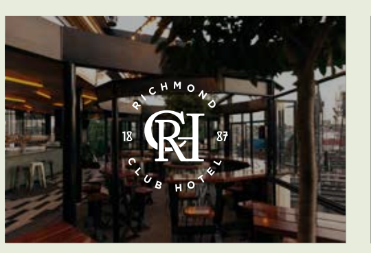
100 Swan Street, Richmond richmondclubhotel.com.au