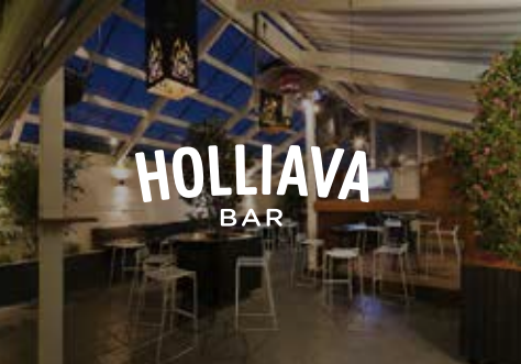
36 Swan Street, Richmond holliava.com.au