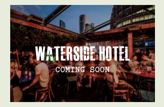
508 Flinders St, Melbourne watersidehotel.com.au