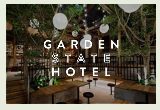
101 Flinders Lane, Melbourne gardenstatehotel.com.au