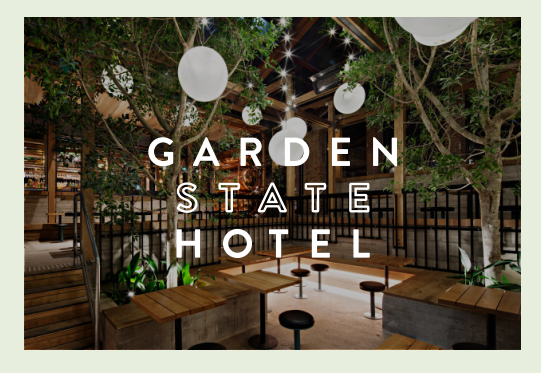
101 Flinders Lane, Melbourne gardenstatehotel.com.au

90 Swan Street, Richmond theposty.com.au