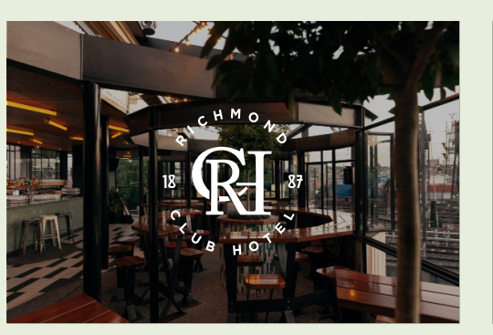
100 Swan Street, Richmond richmondclubhotel.com.au