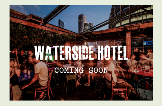
508 Flinders St, Melbourne watersidehotel.com.au