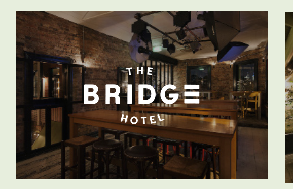
642 Bridge Road, Richmond thebridgehotel.com.au