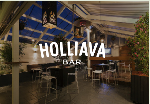
36 Swan Street, Richmond holliava.com.au